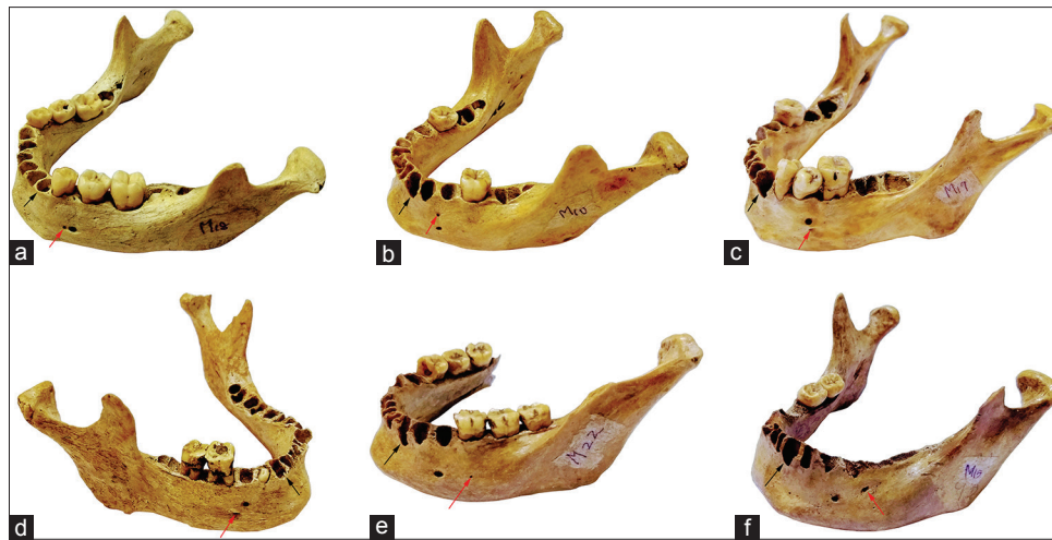
Figure 3: Picture to show the various positions of AMF based on their location (black arrow indicates the canine fossa for reference and red arrow indicates the AMF). (a) AMF below first premolar, (b) AMF between first and second premolar, (c) AMF below second premolar, (d) AMF between second premolar and first molar, (e) AMF below first molar, (f) AMF between first and second molar. AMF = Accessory mental foramina