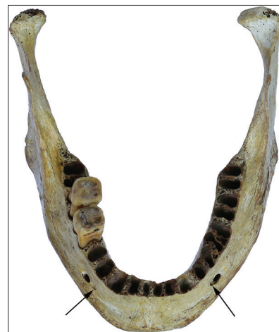
Figure 2: Thin black arrows showing the presence of bilateral accessory mental foramina