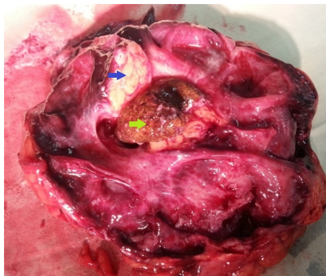
Figure 2. This image shows the tumour at pelvic ureteric junction (blue arrow) and staghorn calculus impacted within dilated pelvis (by green arrow).