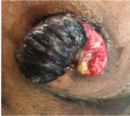
FIGURE 1: Photograph of distal loop prolapse of defunctioning loop ileostomy.

patient did not develop any postoperative recurrence or complications [12].