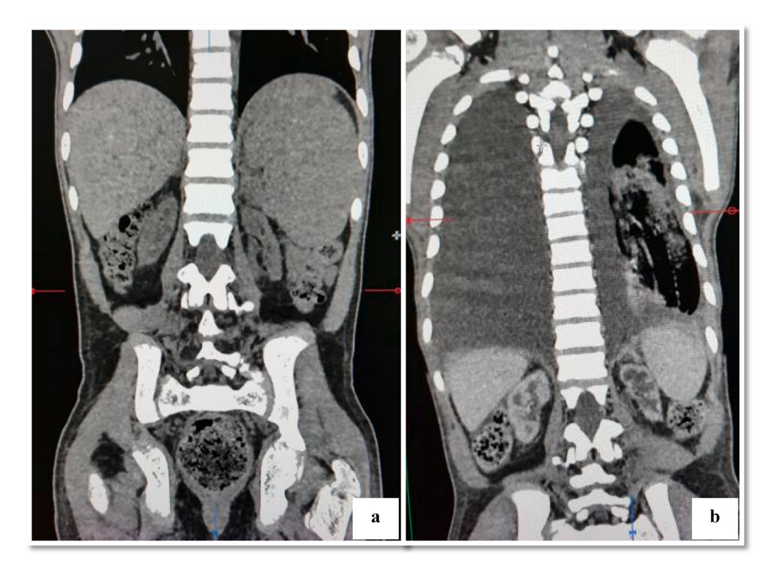
Fig. 1. (a): NCCT/KUB shows bilateral contracted kidney with no stones or obstruction. (b) Contrast CT of kidney and renal angiogram shows contracted kidney with no hydronephrosis and no renal artery stenosis.

Hypertension is commonly found in end stage renal disease patients. Sodium and water retention, activation of RAAS pathway and increased sympathetic activity play a role in pathogenesis of hypertension in end stage renal disease patients. Though hypertension is under control in majority of patients with end stage renal disease, nearly 20 % remain with uncontrolled or resistant hypertension despite the use of pharmacological and volume reduction options [5]. Bilateral nephrectomy has been in practice as a treatment option for malignant hypertension since 1930 [6]. Advent of new classes of antihypertensive drugs, mainly the drugs acting on RAAS and with the advances in dialysis techniques, use of bilateral nephrectomy has declined over the years. Now it is practiced infrequently for refractory hypertension. The prevalence of bilateral nephrectomy as a treatment option ranges from 0 to 7 % in various countries [7]. Bilateral nephrectomy leads to reduction in the levels of renin, angiotensin and aldosterone, which subsequently lowers the blood pressure. It also reduces blood pressure as it decreases the