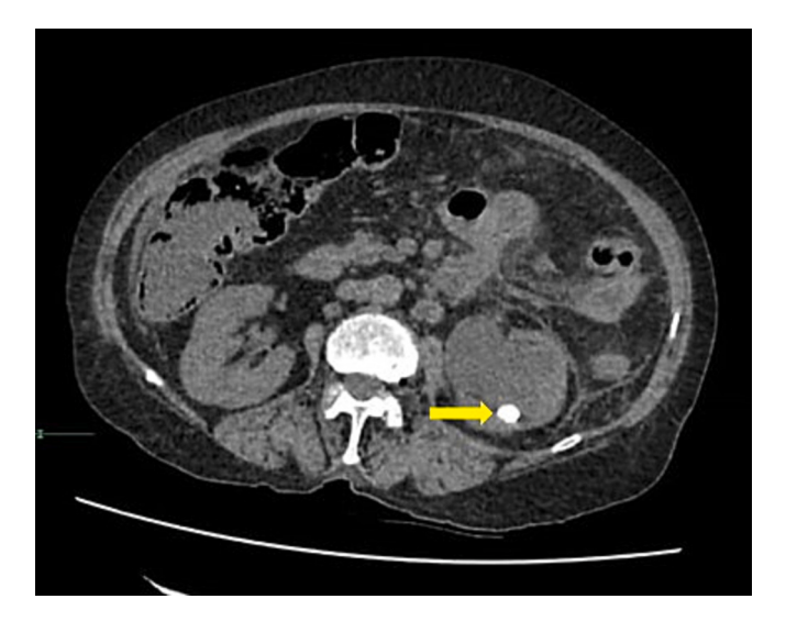
Fig. 1. NCCT showing swollen left kidney and an uncomplicated renal calculus.

clinically and biochemically. An anterograde stenting (Fig. 3) of the left ureter was performed and discharged in eight days of inward management with a plan of follow up imaging in 3 months. No features of urothelial malignancy were seen in follow up contrast urogram and urine cytology. She will be followed up with DTPA scan in another 3 months of time and follow up ultrasound scan and renal function tests every 6 months and her management will be planned accordingly. In case if she develops proximal ureteric stricture, rigid ureteroscopy and laser stricteroplasty will be performed. In case of deteriorating renal functions, subsequent management options will be decided as per multidisciplinary team decisions.