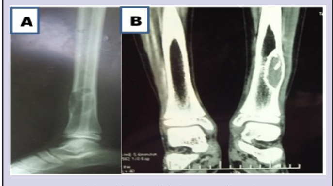
Figure 1: Radiological findings of left tibia A: X-ray film and B: CT scan.

A 12 year old boy referred to orthopaedic unit with complaints of on and off pain and mild swelling on the distal aspect of the left leg for 1 month duration. He did not have past history of trauma on that leg. One month ago, he noticed aching type pain which was exaggerated on playing football. There was no history of fever, loss of weight, and loss of appetite present or contact history with tuberculosis patient. General examination was normal and on limb examination, minimal swelling was noticed over the anterior-lateral aspect of the lower leg. The skin over the tender area was normal. Neuro-vascular system examination revealed normal. Ankle movements were normal and no regional or systemic lymphade-nopathy. X-ray film (Figure 1A) and CT films (Figure1B) showed well-defined expansile lytic lesion at diaphysis of distal end of left tibia. Biopsy was performed and specimen (Figure 2) which confirmed giant cell tumor. Other common giant cell-rich lesions such as aneurysmal bone cyst, osteosarcoma, and nonossifying fibroma were excluded. The patient underwent regular follow up.