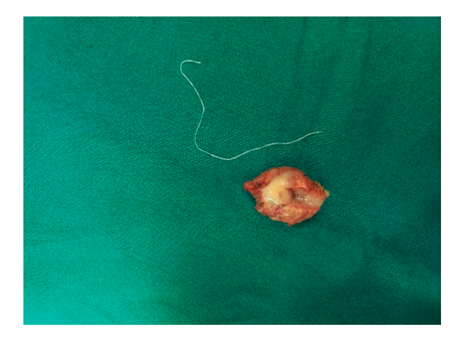
Fig. 2. Worm and the inflammatory lesion.