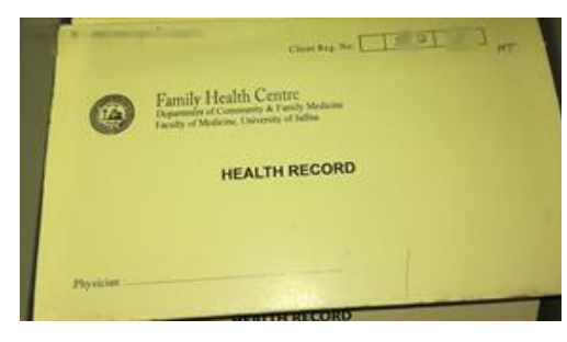
Figure 8: Medical records.