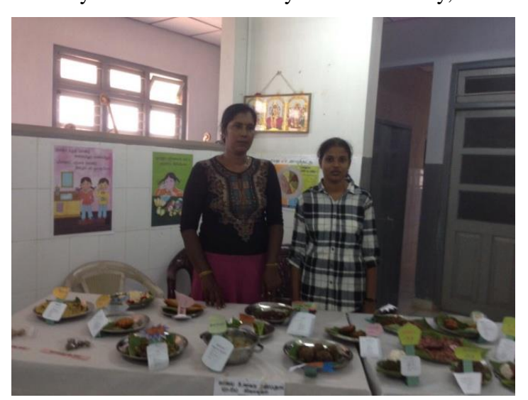
Fig 6: Mothers' Club and MOH Food Exhibition.

Active involvement of local public in health care delivery is paramount to provide efficient primary care; especially in inadequate resource setting. FHC promotes active public involvement in health-related activities such as health promotion, screening, etc. Active public participation is enhanced through a well-planned activity called Community Health Empowerment Project. One of the authors is the Innovator, Coordinator and Program Manager. The project is funded by AHEAD Trust. Public involvement is enhanced by revitalization of local Mothers' Clubs, School Health Clubs, and Elders welfare Societies. Revitalization has taken place through incorporating several self-sustainable and incomegenerating programs like providing healthy traditional food and organizing health canteens. Active community engagement is enhanced by a group of well-wishers from the local community named as Community Welfare Society, Nallur.