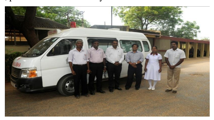
Figure 9: Home visit team.

University of Jaffna provides the necessary transport services for home visits. It is conducted by the Public Health Nursing Sister (DCFM) with the support of community heath assistants. The home visits are aimed mainly providing rehabilitation, palliative care and elderly care.