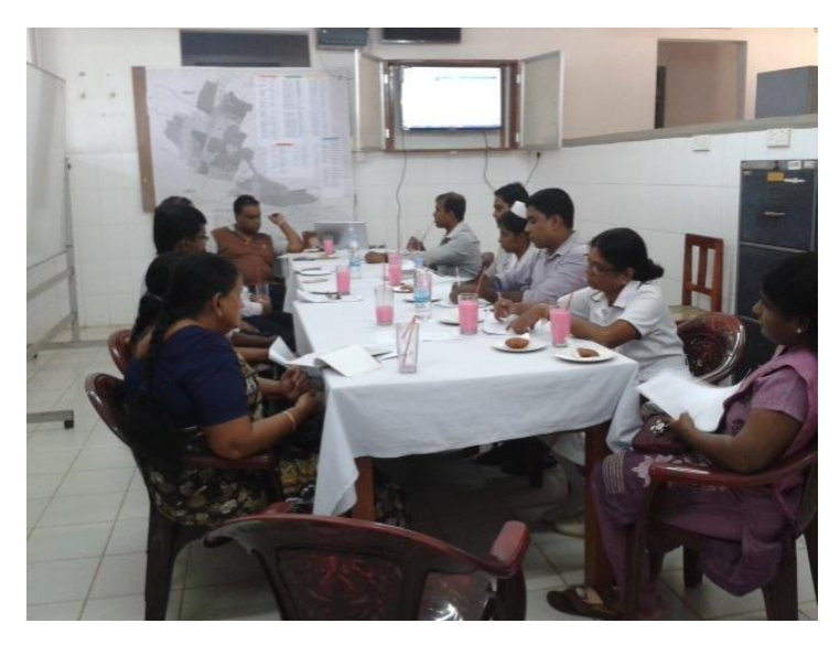
Figure 4: After-action Review Meeting.

Medical Officer (DMO) is responsible for the administration. The clinical work is shared by both parties. Practice meetings (After-action Review Meetings) are conducted every other month, and all stakeholders are invited. The purpose of this meeting is to ensure the effective functioning of COPC.