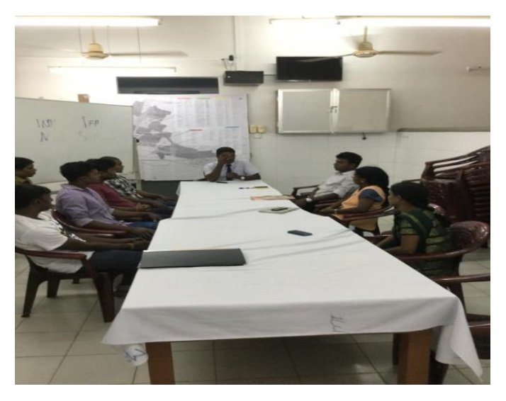
Figure 7: Community Welfare Society Meeting.