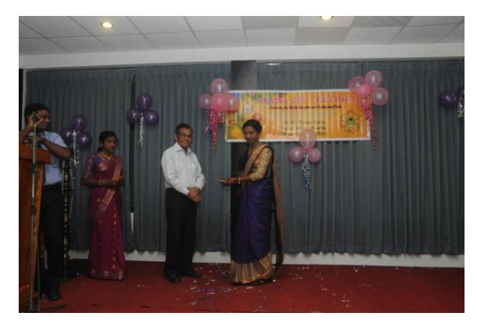
Figure 10: Staff awarding ceremony.

in detail both in verbal and written format. There are various motivation strategies applied to optimize staff performance and appreciating the services of best performers.