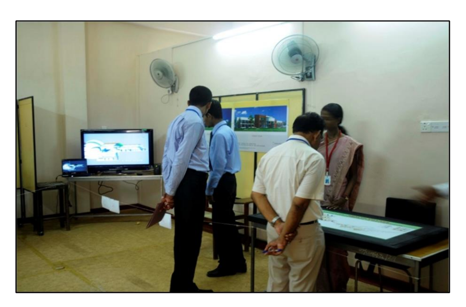
Figure 1: COPC model was visualized at the Medical Exhibition 2010.

The Department of Community and Family Medicine established a model Primary Care Service Delivery System with the help of experts from the University of Jaffna and the Northern Provincial Ministry of Health. As a first step, tentative plan was drafted by the academics at the Faculty of Medicine, University of Jaffna. The team comprised of the Dean of the Faculty of Medicine (2010), Head of DCFM (2010), lecturers and a visiting lecturer at DCFM, and the Regional Director of Health Service, Jaffna (2010). The model was presented at a Medical Exhibition conducted by the Faculty of Medicine, University of Jaffna in 2011 and finalized by incorporating the feedback from the general public and experts from various fields. The initiative was funded by the Provincial Director of Health Service of Northern Province (2010).