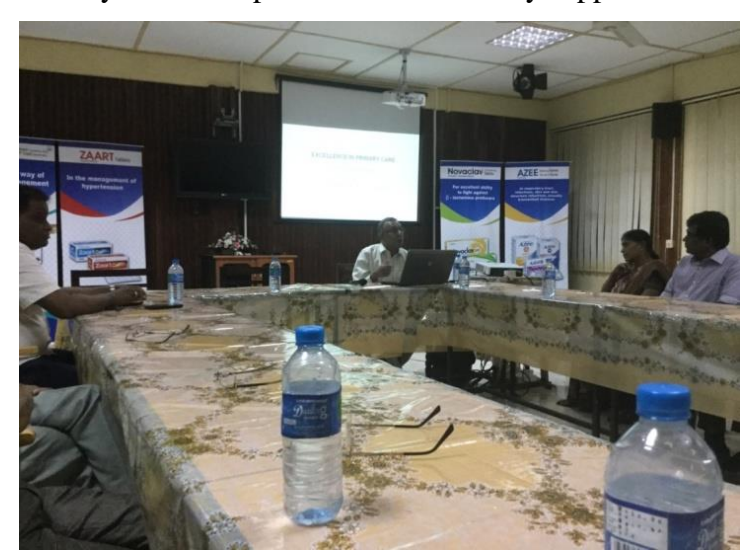
Figure 11: Continuous Medical Education Programme for Doctors.

Continuous medical education (CME) is provided to doctors and paramedical professionals working in primary care. It is in a view of updating their clinical knowledge. CME workshops are organized by the DCFM staff and the members of Community Welfare Society Nallur. It is conducted on monthly basis. The Institution of Family Medicine provides the necessary support to initiate the CME.