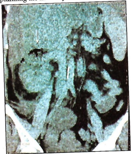
Figure 1: NCCT KUB of a poorly controlled diabetic patient with EPN

However, CT plays a vital role in diagnosis as well as planning the intensity of clinical care.