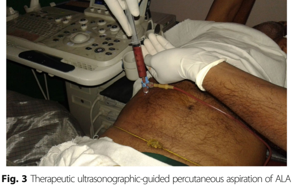
Fig. 3 Therapeutic ultrasonographic-guided percutaneous aspiration of ALA in the right-upper quadrant at THJ—a relatively safe bedside procedure

Educating patients about the harms of regular alcohol consumption is also warranted. There appears to be a lack of understanding amongst the population about regular consumption of alcohol and liver damage [67]. Additionally, there is also a general lack of knowledge amongst patients about ALA, the causative agent, risk factors, and the adoption of preventive measures [6]. The World Health Assembly's adopted resolution EB126.R11, a global strategy to reduce the harmful use of alcohol, has undergone new adaptations, including expanding the evidence base such that it applies to low- and middle-income countries. In addition to this, the WHO has adopted scientific support for the interventions in its new global strategy, including to increase the capacity of health and social welfare systems to deliver treatment and early intervention, limits on alcohol availability, restrictions on alcohol marketing, and pricing policies to discourage alcohol consumption [130].